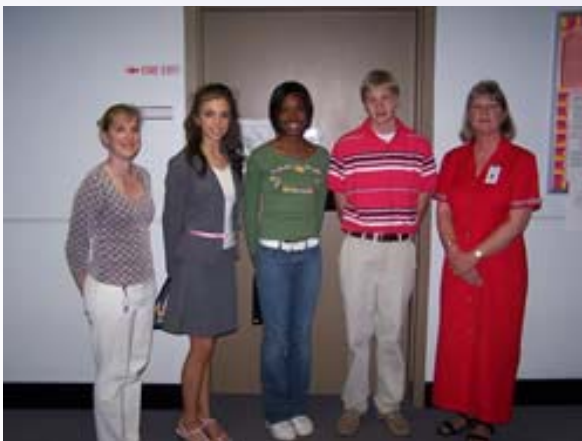
2005 Winners of the Abstinence Essay Contest